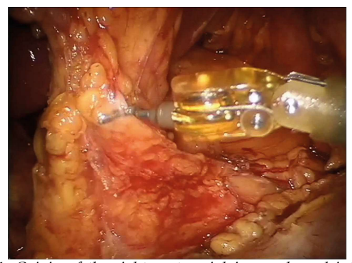
Figure 1: Origin of the right gastroepiploic vessels and infrapyloric lymphnodes (#6).

The division of the gastrocolic ligament continued distally. To do that, the posterior surface of the stomach should be well lifted up, exposing the pancreatico-duodenal area. The superior right colic vein was identified in order to find the gastrocolic trunk of Henle ( Figure 1 ).