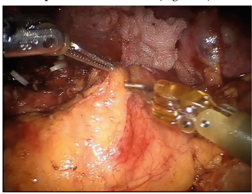
Figure 4: Dissection along the proximal part of the splenic artery.

The course of the splenic artery was identified and the dissection prolonged to include the proximal splenic artery lymph nodes from its origin to halfway between its origin and the pancreatic tail end ( Figure 4 ).