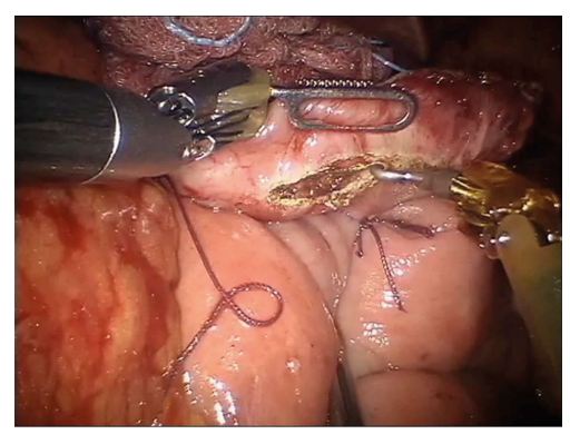
Figure 5: Reconstruction phase: Billroth II gastrojejunostomy.

Final pathology revealed a pT3N2 poorly differentiated adenocarcinoma with 76 nodes examined.