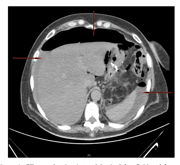
Figure 1: CT scan showing intra-abdominal free fluid and free gas (arrows).

The patient was immediately brought to the operating room, where a diagnostic laparoscopy was performed. The patient was positioned open-legged, with the first operator between the legs and the assistant to the left of the patient, holding the camera and using a 5-mm port. We induced the pneumoperitoneum with a Veress needle in the left Palmer point, then introduced a 30-degree camera through a 12-mm Visiport over the umbilicus and found a massive choleperitoneum ( Figure 2).