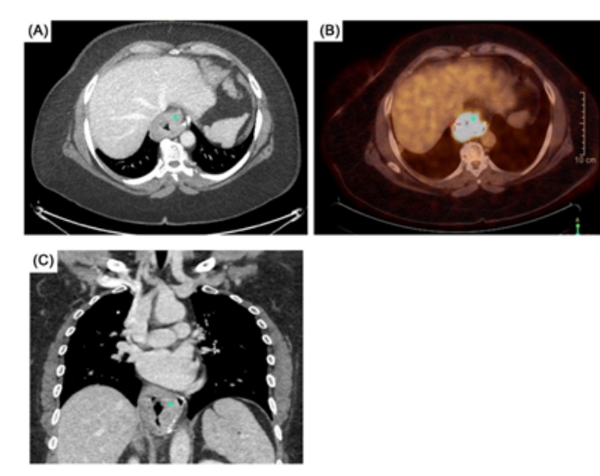
Figure 2: (A) Axial view of CT chest with asterisk showing the cancer, (B) PET-CT with asterisk showing the cancer with hypermetabolic activity, (C) Coronal view of CT chest with asterisk showing the cancer with hiatal hernia noted.).

CAP) and positron emission tomography (PET-CT) showed hypermetabolic polypoid circumferential thickening involving the known herniated stomach with extension into the gastroesophageal junction associated with multiple gastrohepatic and left para-aortic lymphadenopathy ( Figure 2 ).