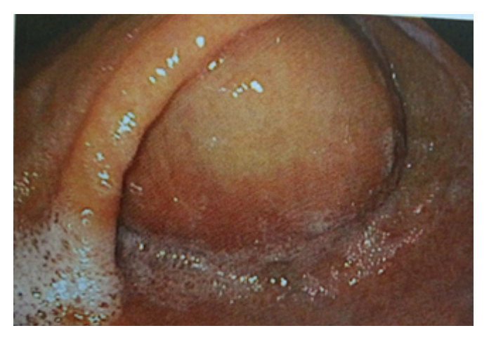
Figure 1: Gastroscopy revealed a giant smooth bulge covered with normal mucosa with a maximum diameter of 7 cm in the gastric antrum that indicated a probable stromal tumor.

A 60-year-old male patient with a history of hypertension was admitted with the chief complaint of upper abdominal pain for 3 month; The pain abdominal distension, and discomfort that was accompanied by a sour regurgitation and weight loss. He had no family history of malignant tumors. Routine blood, routine urine, blood biochemical tests were normal, and the tumor marker test results were all within normal ranges. Gastroscopy revealed a giant smooth bulge covered with normal mucosa with a maximum diameter of 7 cm in the gastric antrum that indicated a probable stromal tumor ( Figure 1 ).