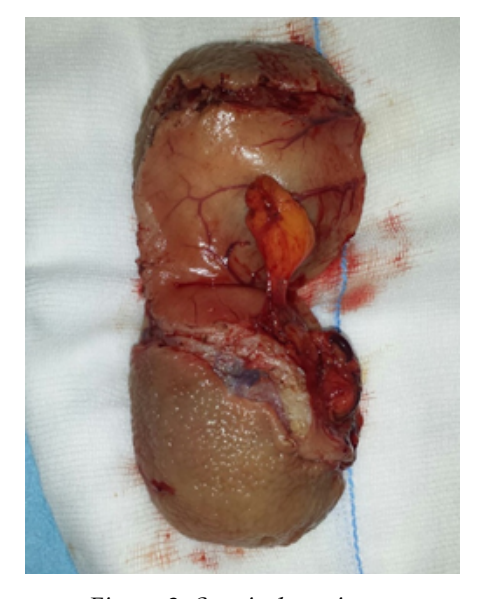
Figure 3: Surgical specimen.

The post-operative course was uneventful. The patient recovered well and was discharged six days after his operation. The histopathology of the gastric fundus indicated GIST; features included spindleshaped cells, no significant atypia, signs of extensive necrosis, mitotic 5/50HPF. Immunohistochemistry demonstrated the following: CD117 (+), CD34 (+), SMA (+), S-100 (-), and vimentin (+) ( Figure 4).